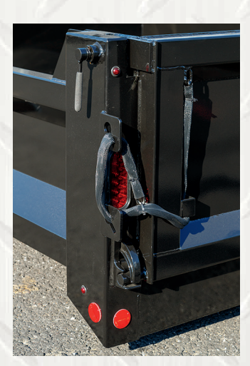
Screw Pin Top Release